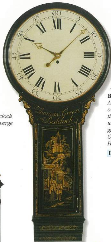
◀ THOMAS GREEN, BALDOCK A very attractive and original George III tavern timepiece with circular white dial and good raised gilt chinoiserie decoration. Circa 1785-90 Height: 59in (150cm)