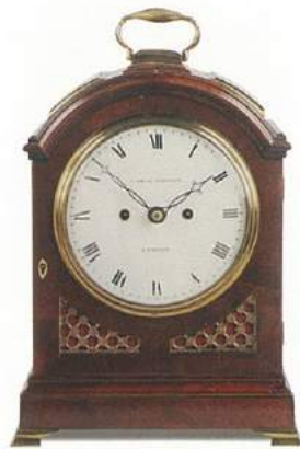
▲ CADE & ROBINSON, LONDON A good Georgian enamel dial bracket clock with three padtop mabogany case, the verge movement with engraved backplate. Circa 1800 Height: 16in (41cm) B