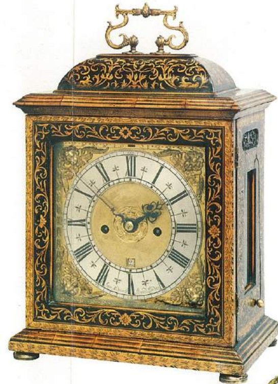
◀ SAMUEL ALDWORTH STRAND LONDON A rare walnut and marquetry dome-topped bracket clock. c.1695. Height: 13 in. (33 cm.).