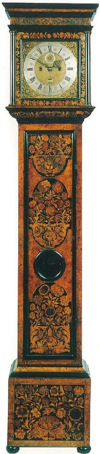
◀ HENRY GODFREY LONDON Fine floral marquetry and burr elm longcase clock. c.1695. Height: 81 in. (206 cm.).