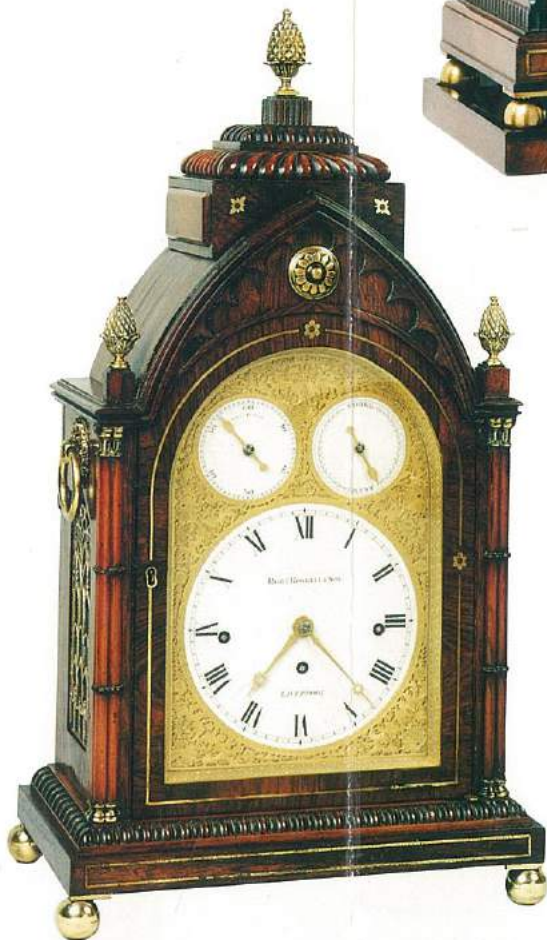
◀ ROBERT ROSKELL & SON LIVERPOOL Superb quality rosewood and brass inlaid quarter-chiming table clock. c.1840. Height: 25 in. (63.5 cm.).