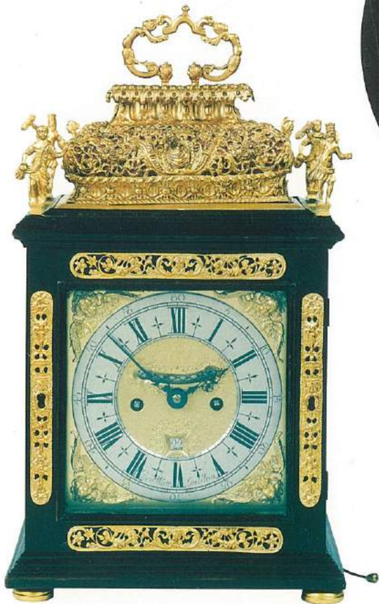
◀ BROUNKER WATTS LONDON An ebony and gilt repoussé basket-top bracket clock striking and pull quarter-repeating on 5 bells. c.1700. Height: 18 in. (45.5cm.).