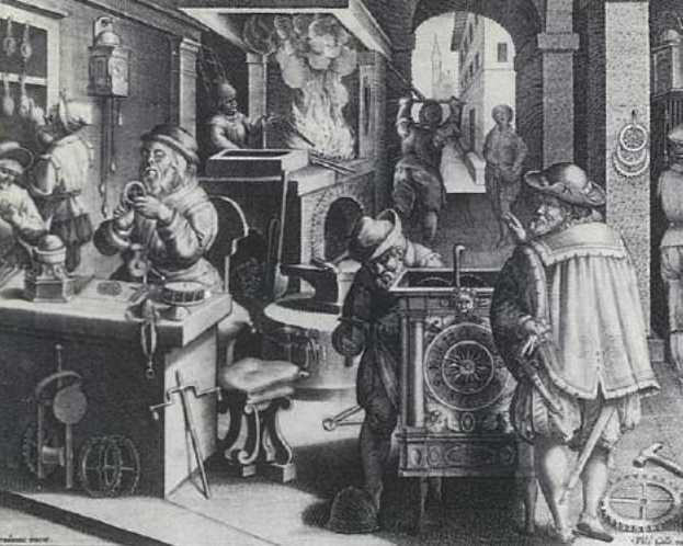
HOROLOGIA FERREA. Rota aqua ferrea aetherisq; volatur, Reclinet aequè et hæc et illa tempora nulla fluenda volucras parat per la regem dæmon, ab omni modo abscidit hæc et aqua...