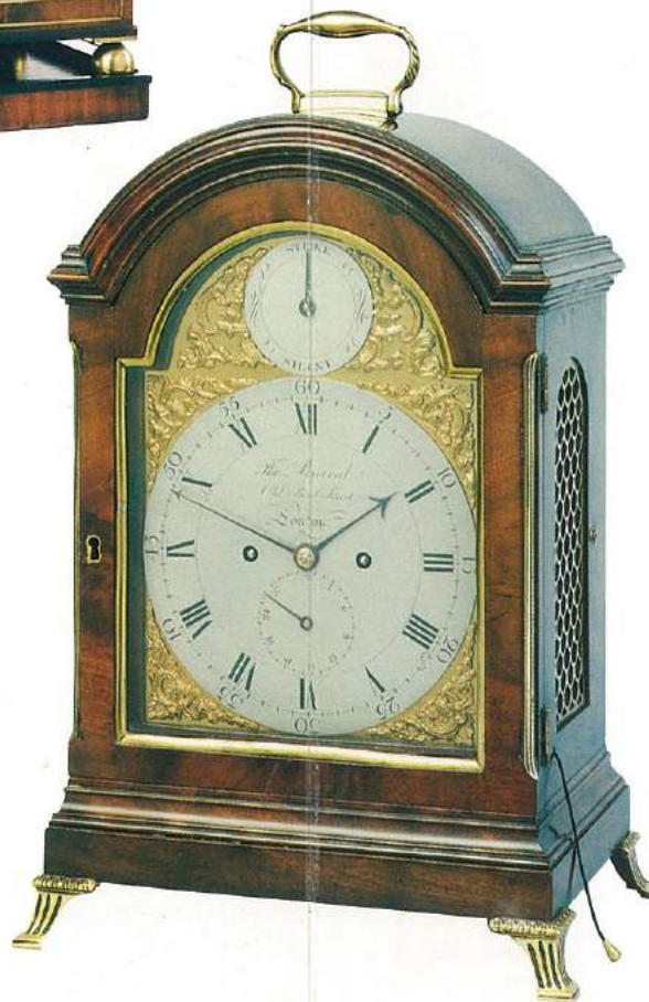
THOS. PERCIVAL ▼ NEW BOND STREET LONDON George III period mahogany arched top striking bracket clock. c.1790. Height: 16 in. (40.5 cm.).