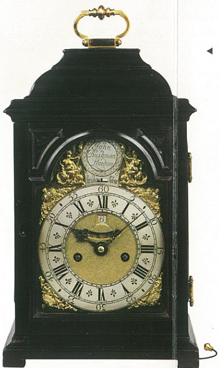
◀ JOHN BUSHMAN, LONDON A fine ebony veneered bracket clock of rare small size, the 8 day hour striking movement with strike/silent and pull quarter repeat on 2 bells. c.1725. Height: 12½ in. (32 cm.).