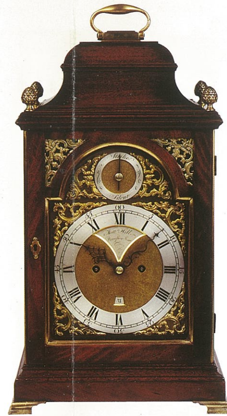
◀ MATHEW HILL, DEVONSHIRE STREET, LONDON A good George III mabogany bell-top bracket clock with 8 day hour striking movement and strike/silent. c.1760. Height: 18 in. (46 cm.).