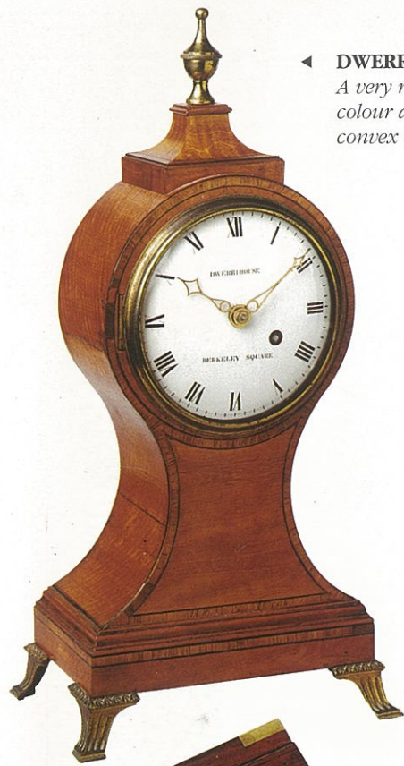
◀ DWERRIHOUSE, BERKELEY SQUARE, LONDON A very rare balloon shape satinwood mantel clock of excellent colour and small proportions, the 8 day timepiece movement with convex enamel dial. c.1810. Height: 17½ in. (44 cm.) incl. finial