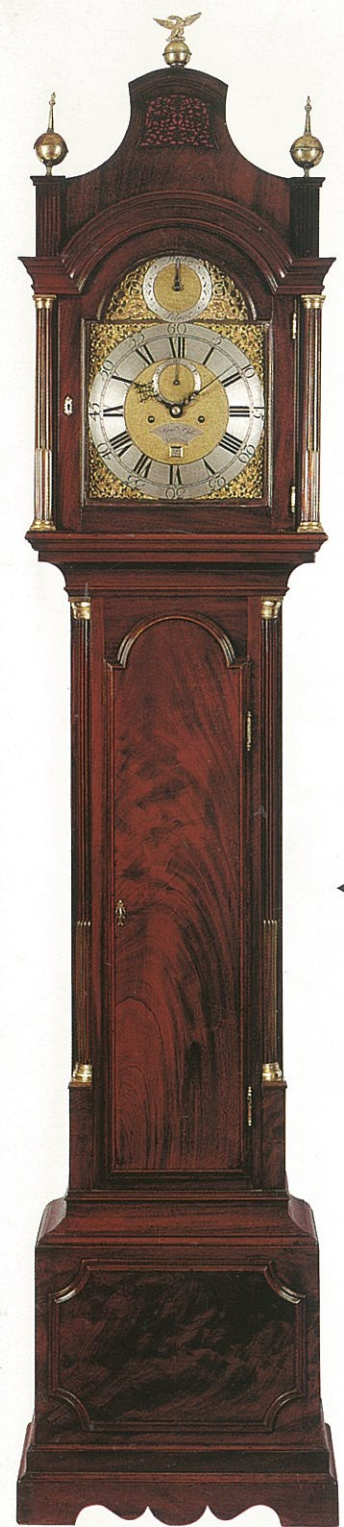
◀ BENJAMIN PYKE, LONDON A good London mahogany pagoda topped longcase clock, the 8 day movement with hour strike and strike/silent. c.1770. Height: 94 in. (239 cm.).