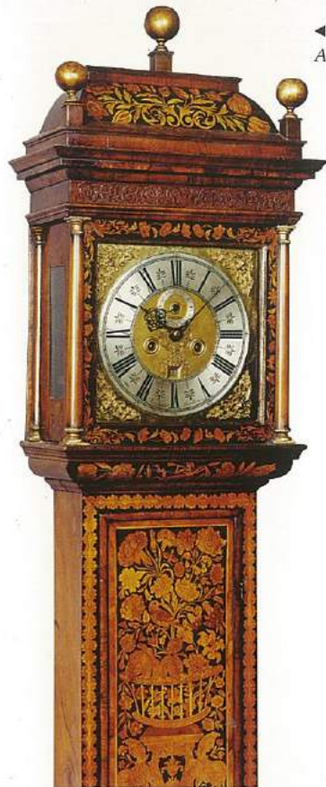
◀ JOSEPH WINDMILLS, LONDON A fine quality floral and bird marquetry longcase clock with original caddy top. Circa 1700 Height: 96 in (244 cm)