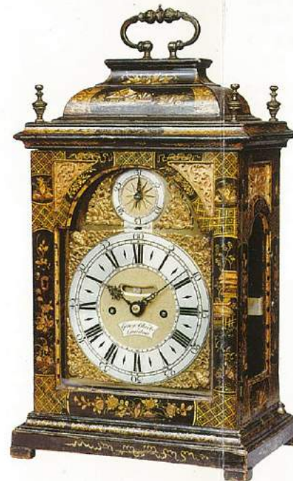
▲ GEORGE CLARKE, LONDON An untouched black and gilt lacquer table clock by this eminent maker. The 8-Day hour striking movement with strike/silent and calendar in the arch. Circa 1740 Height: 17 in (43 cm)