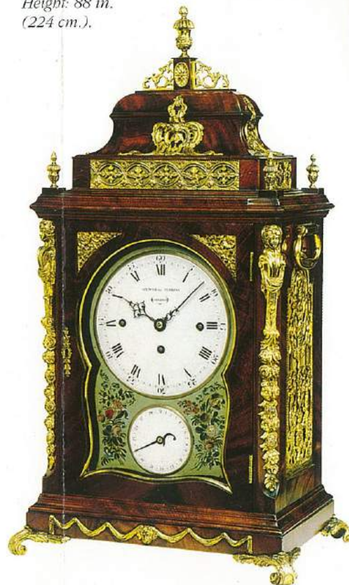
▶ SPENCER & PERKINS, LONDON A superb George III mahogany and gilt-mounted table clock, the 8-day movement quarter-chiming on 8 bells and with hour strike. The signed enamel dial has a subsidiary date indicator set within a pretty painted floral surround. c.1790. Height: 26½ in. (67.3 cm.)