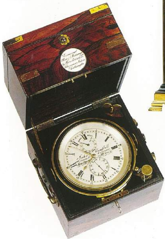
▲ JOHN CAMPBELL, LIVERPOOL No. 818 A good 2 Day marine chronometer in a fine brass bound rosewood box, c.1850. 6¾ in. x 6¾ in. (17.5 cm x 17.5 cm)