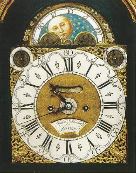
▲ JOHN TRABET, LONDON Detail of moonphase bracket clock in a cream yellow lacquer case. c.1750.