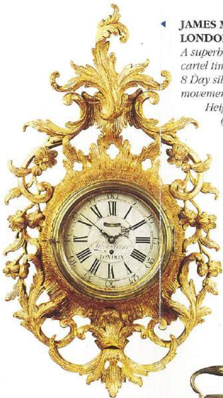
◀ JAMES MYLBORNE, LONDON A superb English giltwood cartelpiece with 8 Day silvered dial movement. c.1780. Height: 36 in. (91.5cm.).