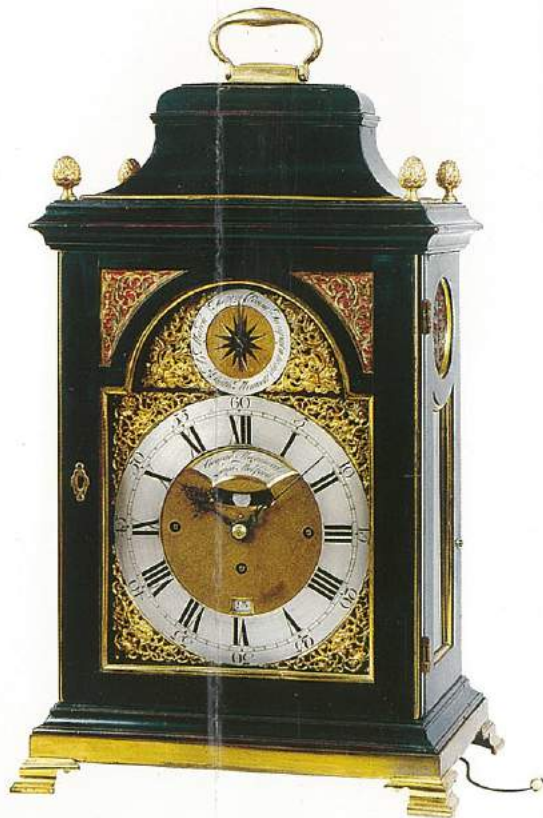
▲ GEORGE MAYNARD, LONG MELFORD A fine Georgian musical bracket clock playing a choice of one of four tunes in an ebonised and brass moulded bell top case. c.1780. Height: 32 in. (56 cm.).