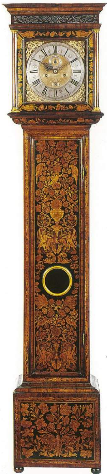
◀ MATHEW CROCKFORD, LONDON A beautiful floral marquetry longcase with 8 Day hour striking movement. c.1695. Height: 80 in. (203 cm.).