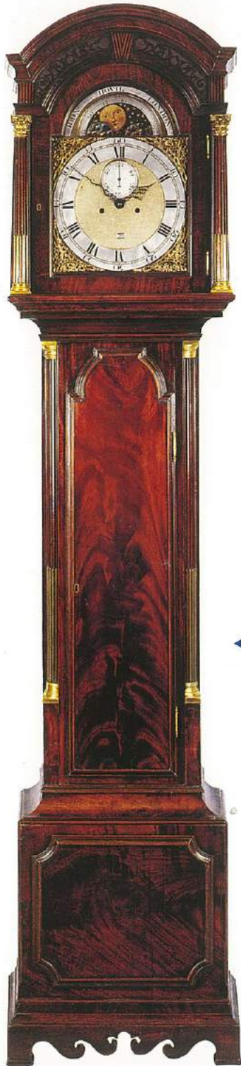
◀ JOHN HOVIL, LONDON A fine George III mahogany longcase clock with 8 Day moonphase movement and strike/silent. Height: 90 in. (229 cm.).