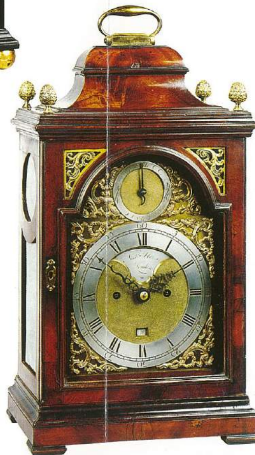
▼ NATHANIEL PLANNER, LONDON A good mahogany bell top bracket clock with 8 Day movement and strike/silent, the case of good proportions. c.1770. Height: 18 in. (46 cm.).