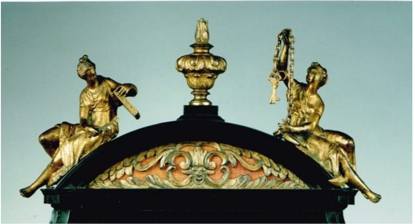
Detail of Saints Basilisa and Anastasia on a Charles II period table clock.

We will of course also have fine antique furniture on display, including an unusual George II period bureau bookcase with a clock above the glass doors. What will unite all the items on view is a sense of history and incredible craftsmanship. From the fine clock movements with their engraved backplates to the stunning veneers and gilded mounts, there will be something to tempt, intrigue and fascinate everyone who loves the best antique clocks and furniture.