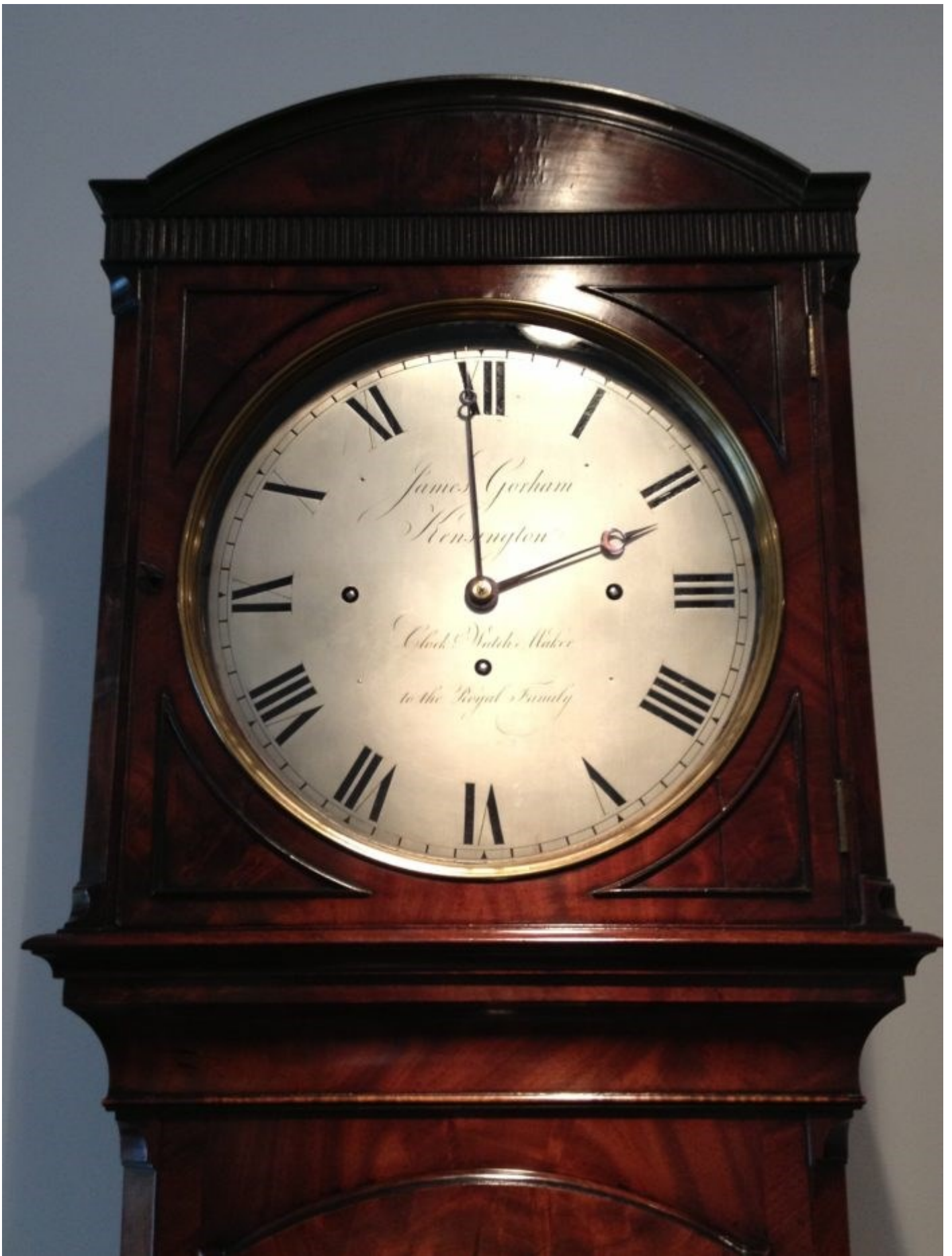
Detail of the Dial of the Gorham Longcase clock at Raffety Clocks.