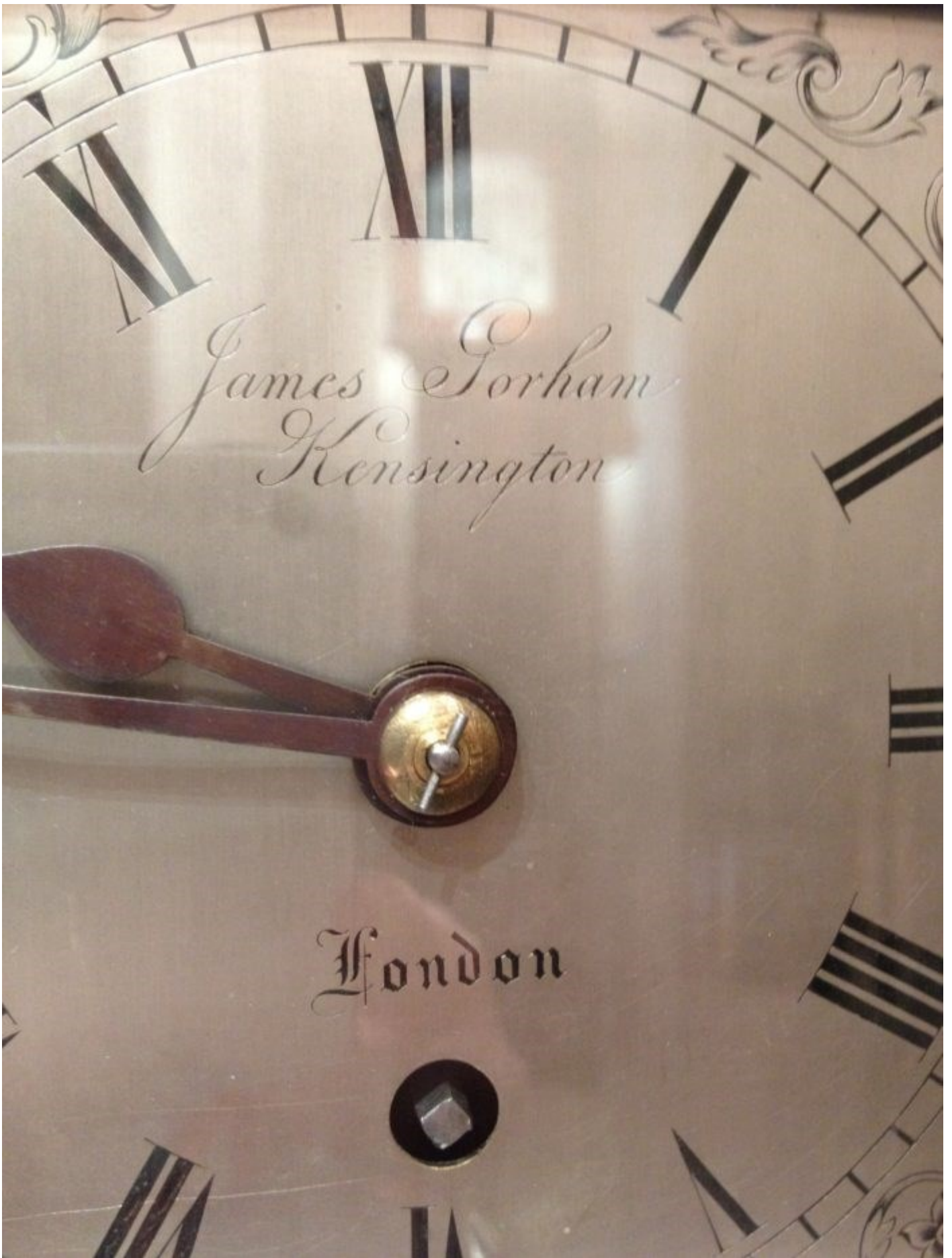
Detail of the clock face.

The second Gorham clock is an exquisite Regency period 3-train quarter striking longcase. The elegant mahogany case has