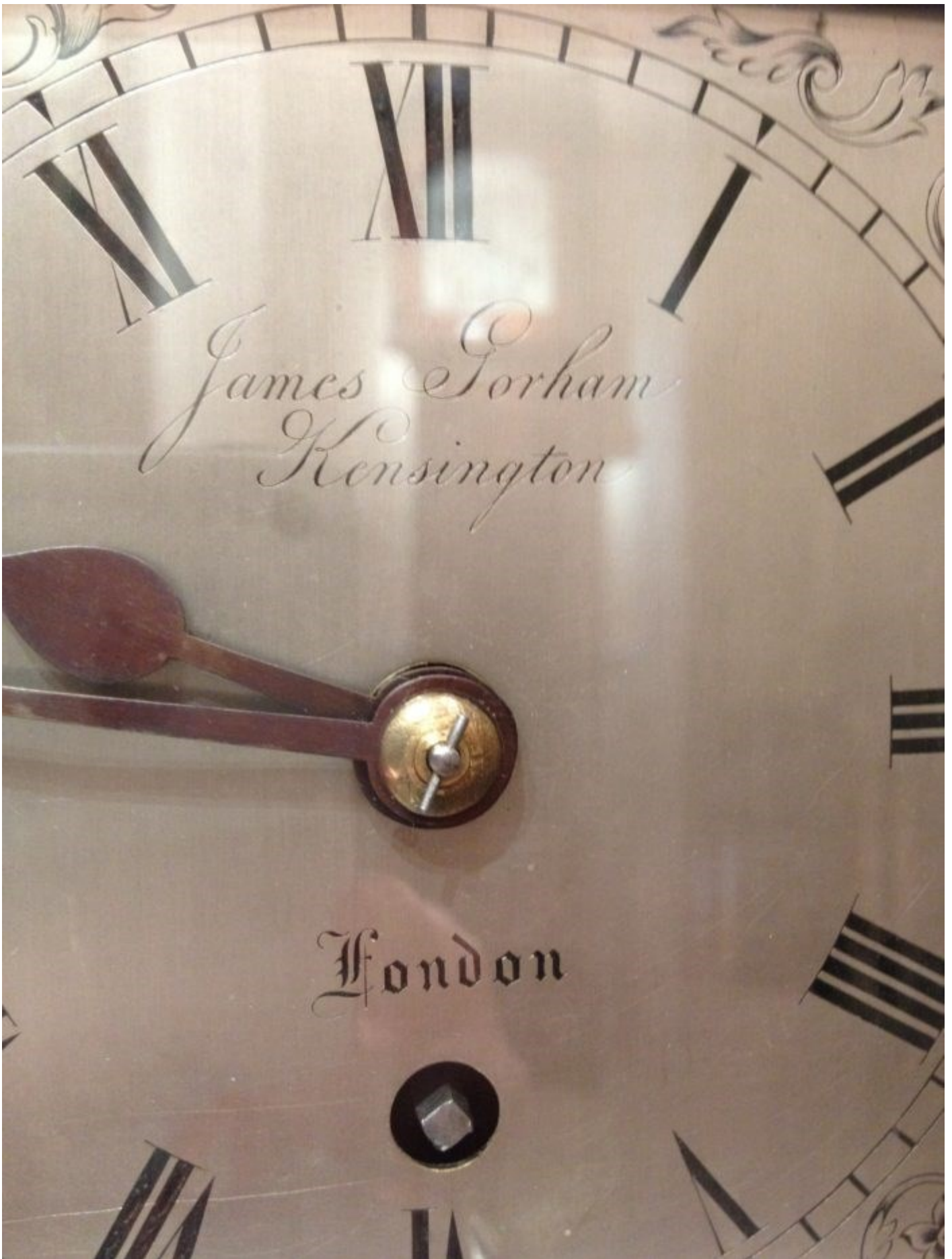
Detail of the clock face.

The second Gorham clock is an exquisite Regency period 3-train quarter striking longcase. The elegant mahogany case has