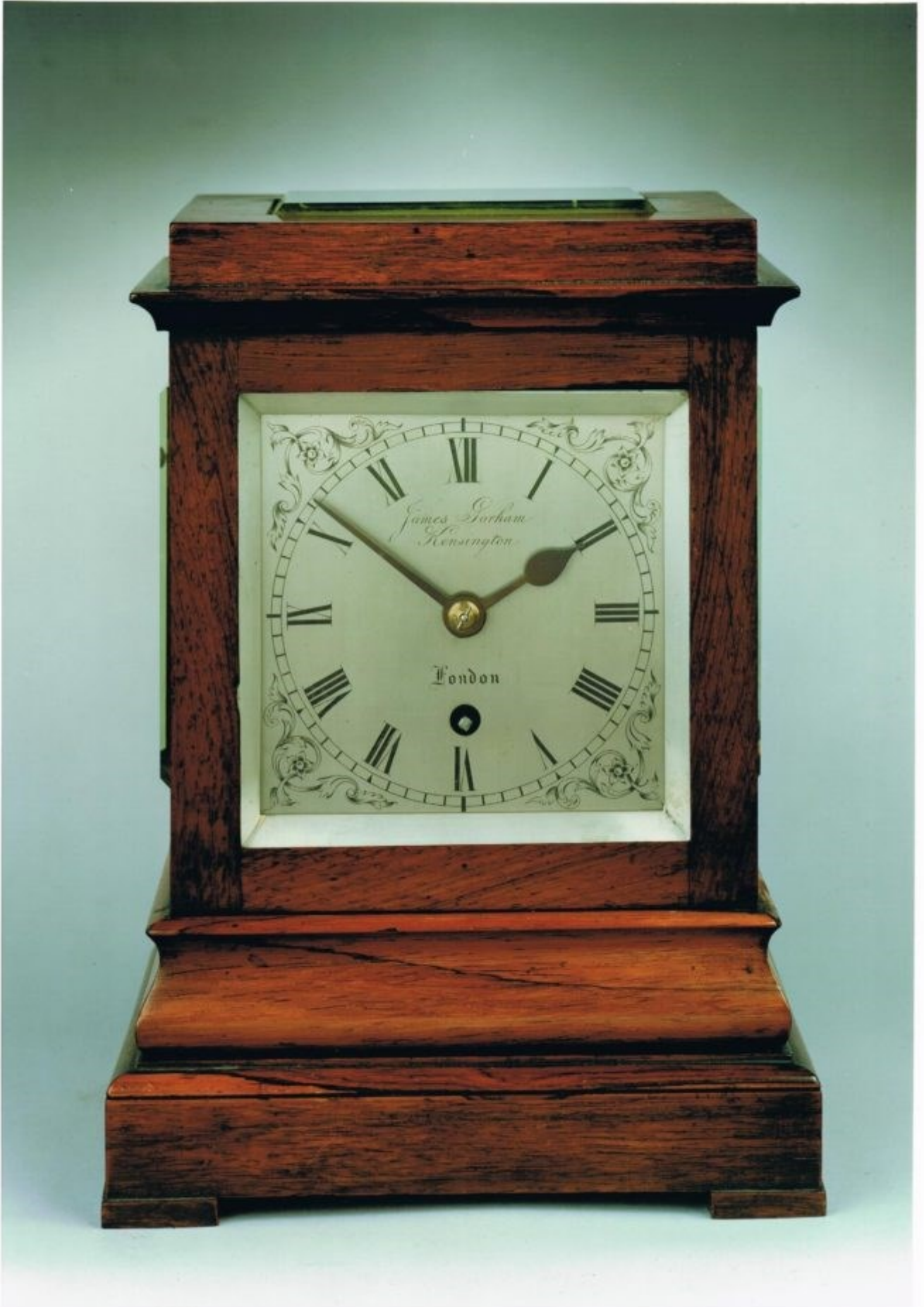
Four Glass table Clock by James Gorham.