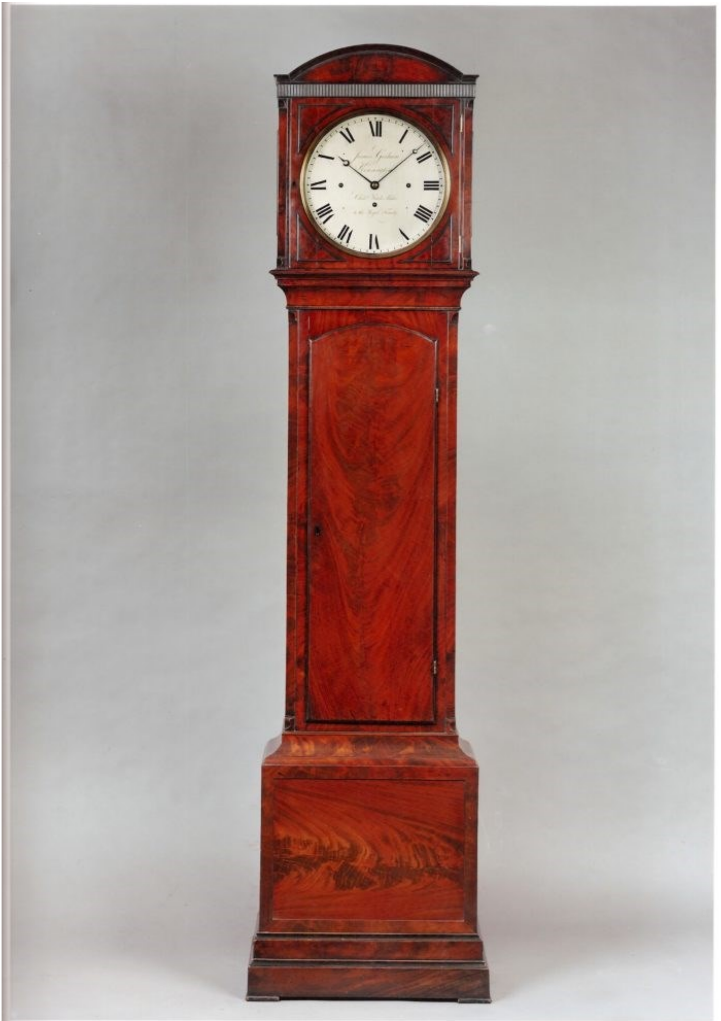
Longcase clock by James Gorham.