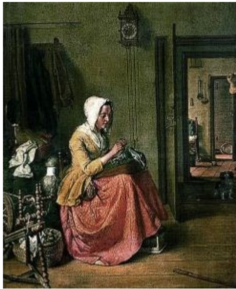
Painting of a house interior with wall clock. Artist unknown.

Their heavy weights and tactile elements – requiring you to pull the weight cable every day – make them still very popular and fun too. Some, like this example by John Ebsworth of Lothbury, London, had “winged” side doors to show off the centrally swinging pendulum. This example dates from about 1685 and strikes the hours on a large single bell which surmounts the engraved brass case that encloses the verge movement. Lantern clocks stayed popular throughout the 18th century, and sometimes had the additional of a minute hand.