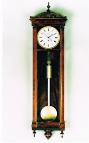
An Austrian regulator timepiece with mahogany case by Brutmann in Wien. Circa 1850. Raffety Ltd

Leaving Britain briefly, one final example of a wall clock to be found in the Raffety gallery are Austrian regulators. These also date to the 19th century and were intended to show off the fine quality, accurate movements. Thus, everything about the design is focused on displaying the construction of the clock. This example, signed 'Brutmann in Wien' has a mahogany case designed with large glass panels to show off the large steel flat rod pendulum and weight, with decorative flourishes limited to the pie crust pediment and carved finials to top and bottom. Glass panels to the sides of the dial offer a view of the movement. Although this was made around 1850, its crisp design give it a very contemporary look.