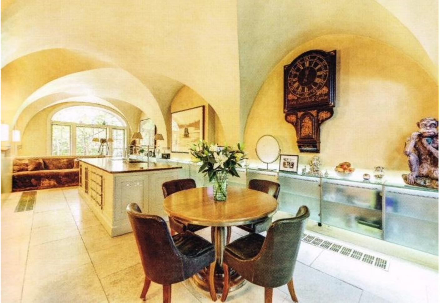
Modern kitchen interior with a prominent tavern clock on display.

If you happen to follow Raffety Clocks on Instagram, Twitter or Facebook, you may have noticed that this October we have been showcasing wall clocks. There is a good reason for this. If you are new to clocks and collecting, then a wall clock makes an ideal first purchase – and if you are a true horology aficionado, then wall clocks are a necessity.