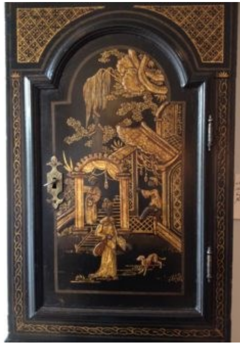
Detail of chinoiserie decoration with pavilion and landscape, on a tavern clock by John Johnson, London. Circa 1760. Raffety Ltd.

Over the long reign of George III there are even more wall clock choices. Just as coach and postal services may have influenced the rise of tavern clocks, so too the growth of commerce and even the popularity of cookery books seems to have influenced wall clocks. Banks and offices, along with servants halls and kitchens in stately homes found a need for a wall clock to keep track of business times, cooking durations, and the daily round of events and activities. These tended to consist of a large silvered, painted or enamelled round dial with the movement and pendulum encased within a round wood case.