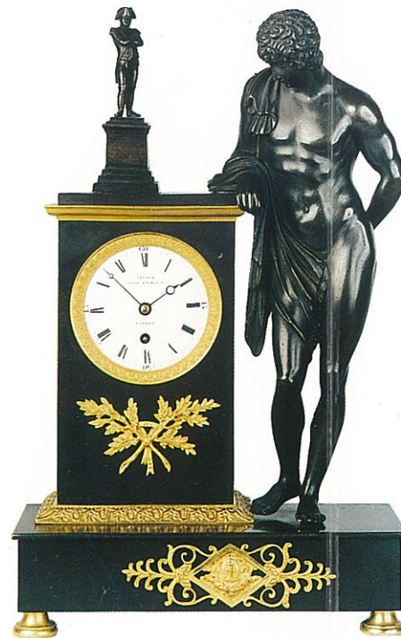
◀ A French Empire ormolu and patinated bronze mantel clock with a figure of Napoleon. c.1810. Height: 14 in. (35.5 cm.).