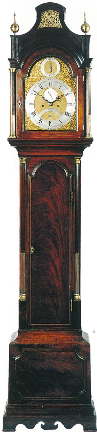
◀ HALEY & SON LONDON A fine George III period mahogany longcase clock with strike/silent in the arch. c.1770. Height: 95 in. (240 cm.).