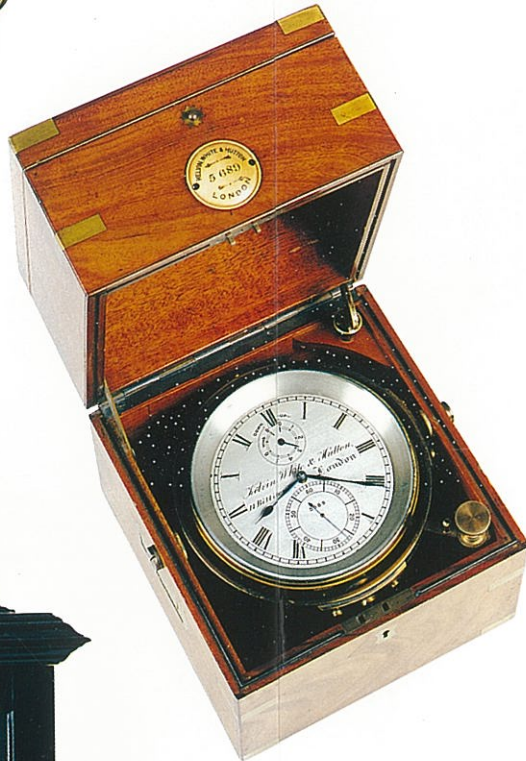
KELVIN WHITE & HUTTON LONDON A good 8 day chronometer in a fine brass bound mahogany box. c.1900. Dimensions: 8 1/4 in. x 8 1/2 in. (21 x 21.5 cm.).