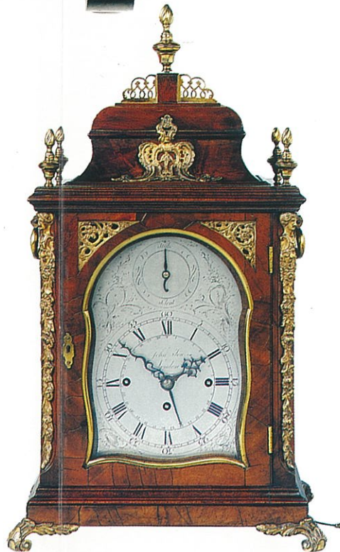
JOHN STEPHENS LONDON ▶ A good Ellicott style George III mahogany striking bracket clock. c.1770. Height: 19 in. (48 cm.).