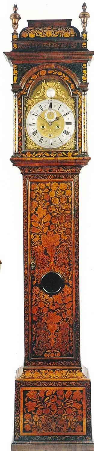
◀ WILLIAM SPEAKMAN JUNIOR OLD STREET LONDON A handsome floral marquetry 8 day longcase clock by this reputed maker. c.1710. Height: 98 in. (250 cm.).