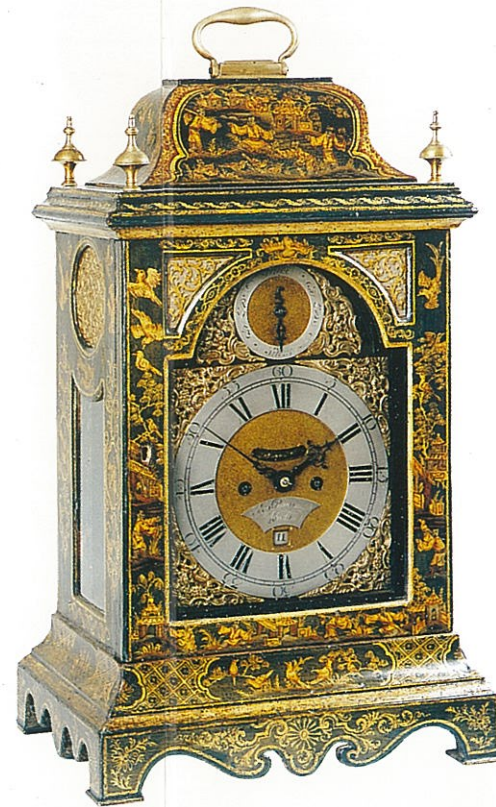
◀ STEPHEN RIMBAULT LONDON A George III period green and gilt chinoiserie bracket clock in exceptionally original condition. c.1760. Height: 20 1/2 in. (52 cm.).