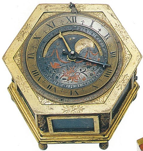
◀ ZOLLER AUGSBURG A small and rare early 17th century gilt hexagonal table clock with moonphase. c.1600.