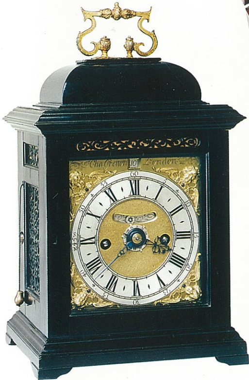
◀ CHARLES GRETTON LONDON An exceptional small ebony veneered bracket clock with alarm and pull quarter repeat. c.1695. Height: 11 in. (28 cm.).