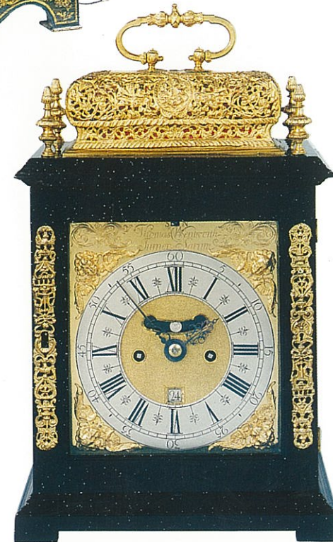
THOMAS WENTWORTH JUNIOR SARUM An ebony and gilt repoussé basket top bracket clock, striking and pull quarter repeating on 3 bells. c.1700. Height: 15 in. (38 cm.).