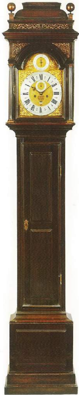
◀ CHARLES GOODE, LONDON A fine George I period panelled and ebonised Dutch striking longcase clock. The 12 inch arched dial with cherub spandrels and finely matted signed centre. Circa 1725 Height: 98 in (248.9 cm)