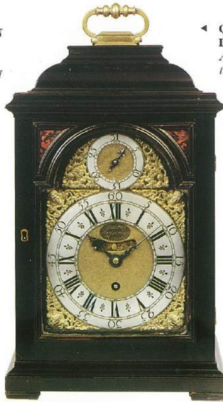
◀ QUARE AND HORSEMAN, LONDON, NO. 304 An ebony veneered bracket timepiece by this famous partnership, the arched dial and finely engraved backplate fully signed, with pull quarter repeat on two bells. c.1720. Height 16½ in. (42 cm).