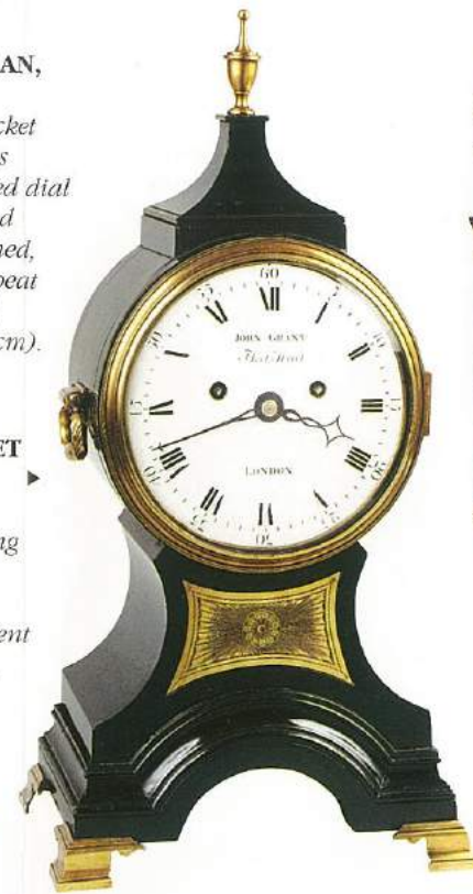
▶ JOHN GRANT, FLEET STREET, LONDON A stylish George III ebonised hour striking balloon clock, the enamel dial and double fusee movement both signed. c.1790. Height 18¼ in. (46 cm).