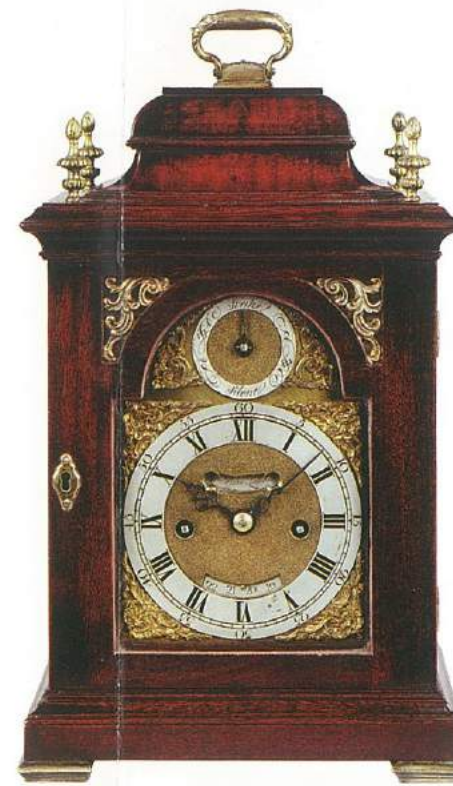
◀ GEORGE PYKE, LONDON A small and rare George II mahogany striking bracket clock, the individually styled inverted bell-top case with signed dial and verge escapement. c.1745. Height 13 3/4 in. (35 cm).