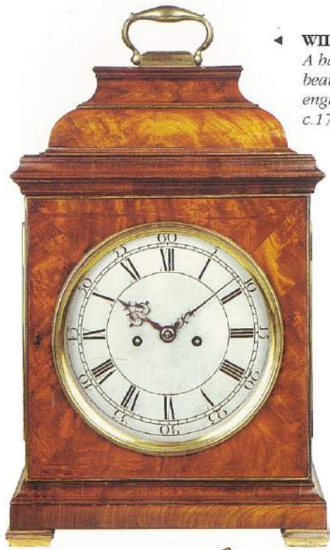
◀ WILLIAM WEBSTER, EXCHANGE ALLEY, LONDON A handsome George III period mahogany bracket clock, with beautifully figured veneered case. The 8-day movement with engraved backplate and pull quarter repeat on six bells. c.1770. Height 18 in (46 cm).