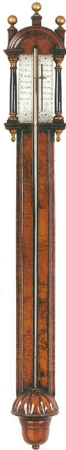
◀ A very rare walnut George I period stick barometer, the patinated and highly figured veneered case with gadrooned cistern cover. c.1725. Height 39 in. (99 cm).