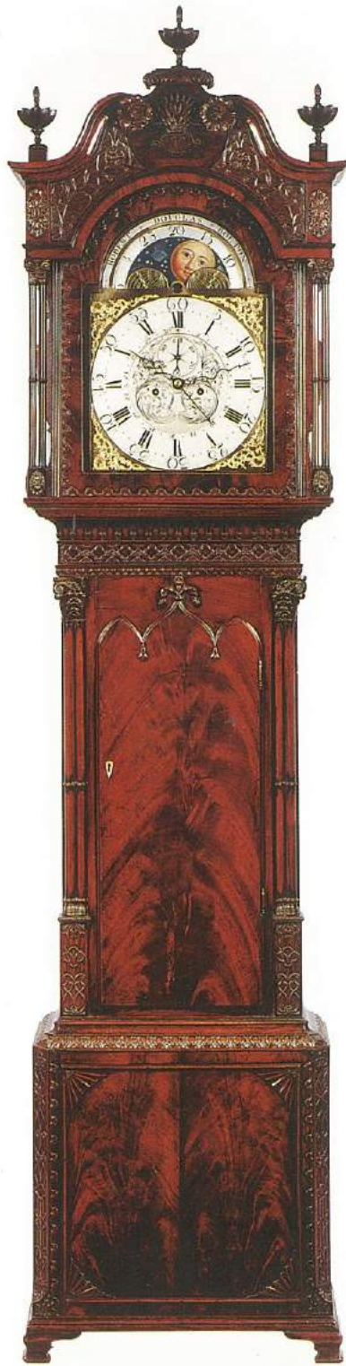
◀ ROBERT DOUGLAS, BOLTON An exceptional Lancashire Chippendale mahogany longcase clock of the George III period, the case overlaid with flowers and foliage, the dial with revolving moon in the arch. c.1780. Height 98 in. (250 cm).