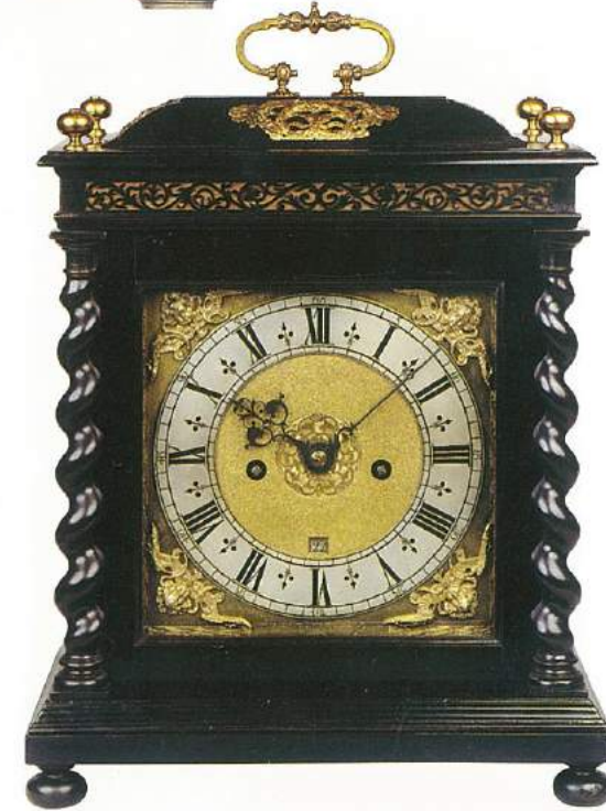
▼ EDWARD BIRD, LONDINI FECIT An important James II period table clock on later turntable base, the 8-day movement with exquisite tulip engraved backplate and countwheel strike. c.1685. Height 17 1/2 in. (44.5 cm).