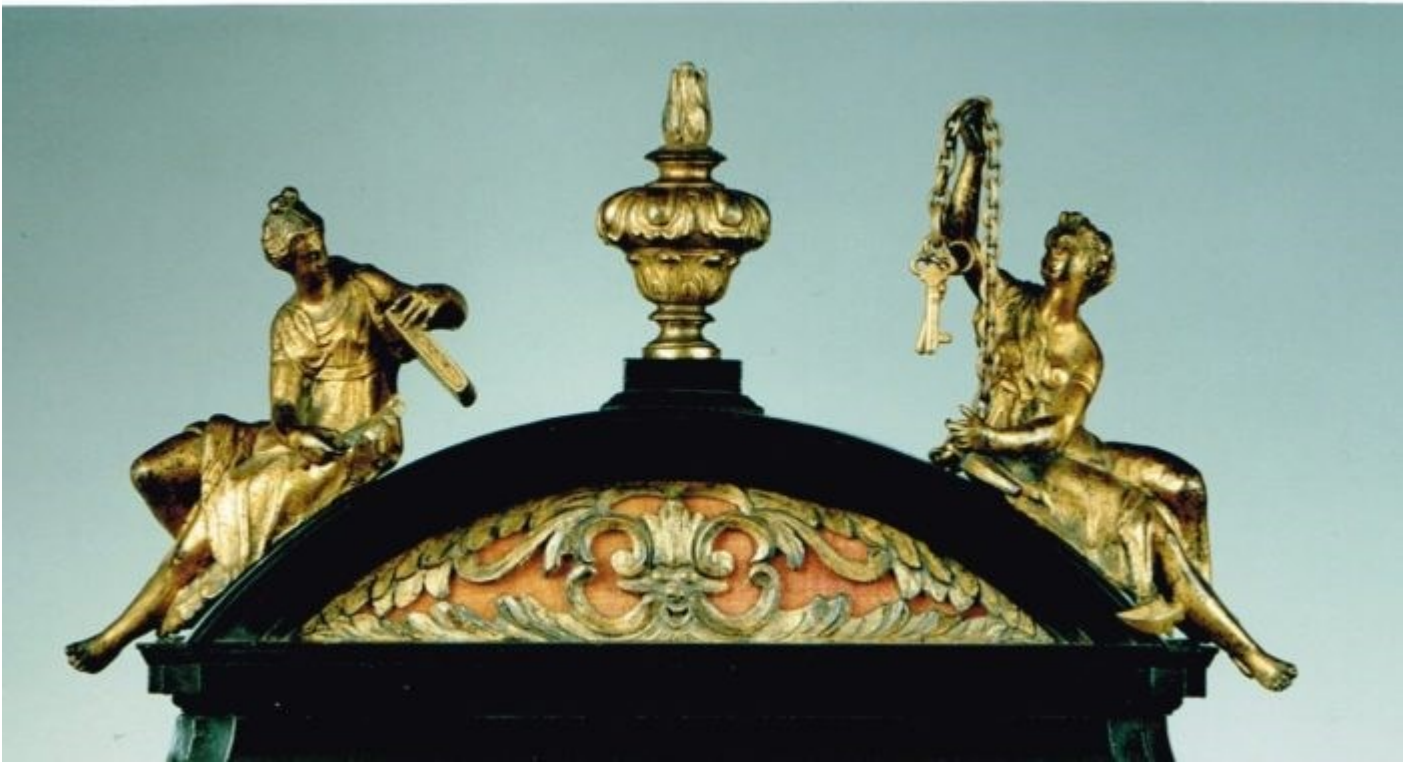
Detail of Saints Basilisa and Anastasia on a Charles II period table clock.

We will of course also have fine antique furniture on display, including an unusual George II period bureau bookcase with a clock above the glass doors. What will unite all the items on view is a sense of history and incredible craftsmanship. From the fine clock movements with their engraved backplates to the stunning veneers and gilded mounts, there will be something to tempt, intrigue and fascinate everyone who loves the best antique clocks and furniture.