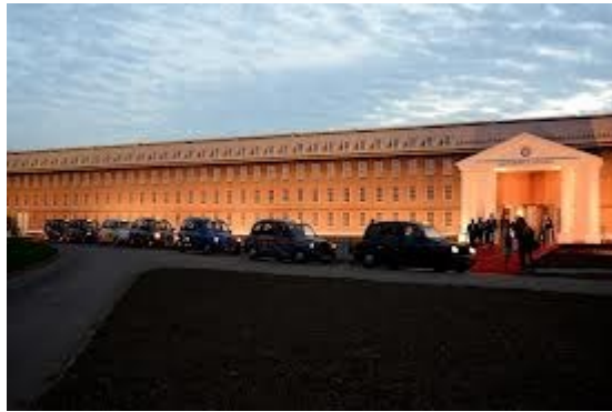
A view of Masterpiece Fair Building at Royal Hospital, Chelsea.

The jewel in the crown of arts fair season is undoubtedly the Masterpiece Fair, which takes place in the magnificent grounds of the Royal Hospital Chelsea, June 27-July 3, 2013. Barely a month previously the hospital grounds have hosted the venerable Chelsea Flower Show, but as soon as the marquees and gardens for this event are dismantled a new edifice begins to rise at Chelsea.