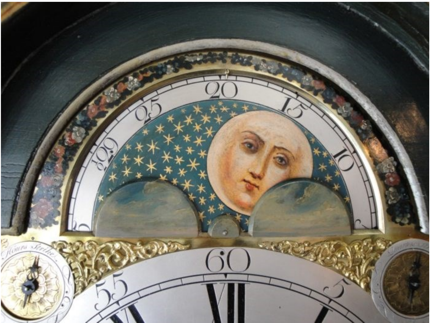
Detail of a clockface with moon phase. Raffety Antique Clocks

And of course there will be the finest clocks for sale too! Raffety Clocks of Kensington Church Street will be exhibiting at Masterpiece once again. Nigel Raffety has managed to assemble a sumptuous stand of horological masterpieces dating mainly from the seventeenth and eighteenth centuries. After many weeks of research, and then an agonising few days of packing and preparation, our Masterpiece stand, B16, is almost ready to welcome you.