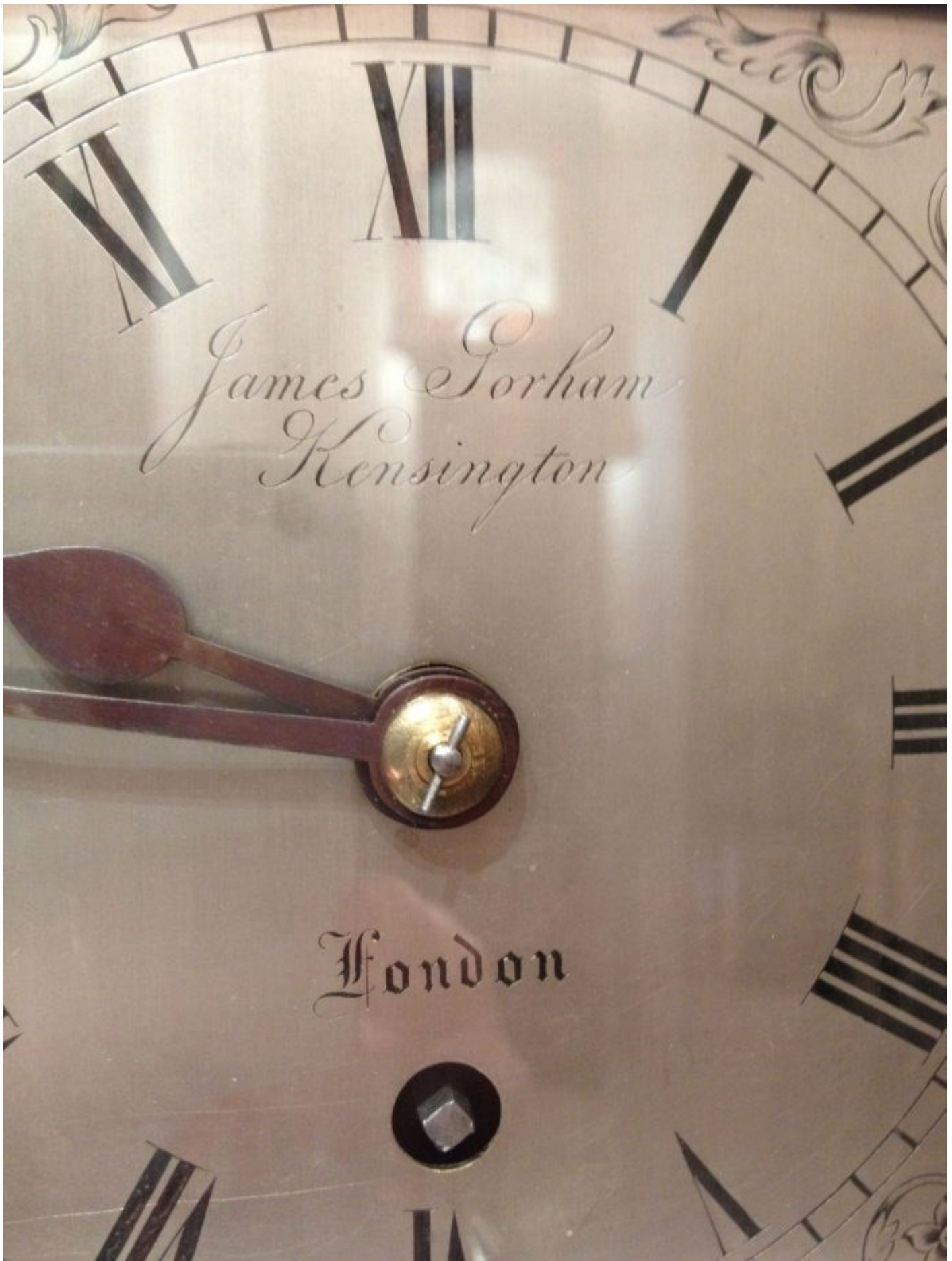
Detail of the clock face.

The second Gorham clock is an exquisite Regency period 3-train quarter striking longcase. The elegant mahogany case has