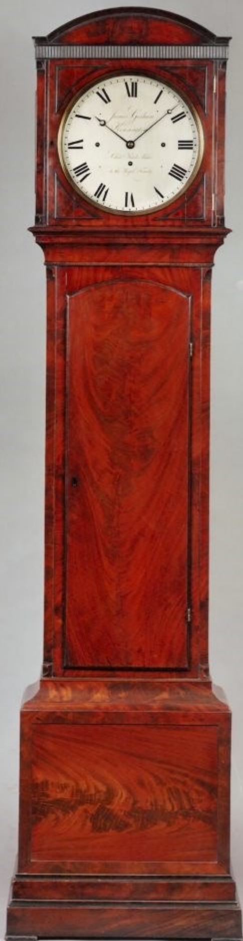
Longcase clock by James Gorham.