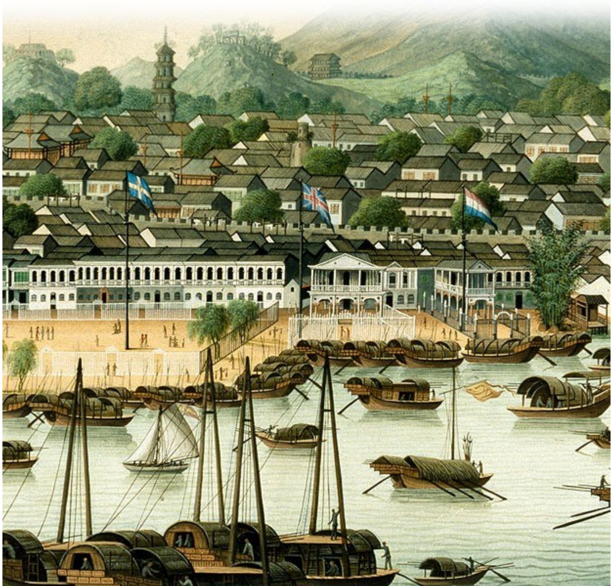
View of the Trading Port of Canton in the Early 19th Century.

Trade improved further and by the next generation England had become the most important trading country in the world. The importation of silks, ceramics and decorative objects in lacquer were being unloaded by the docks every week and the auctions of precious cargoes took place at East India House, the company headquarters in Leadenhall Street.