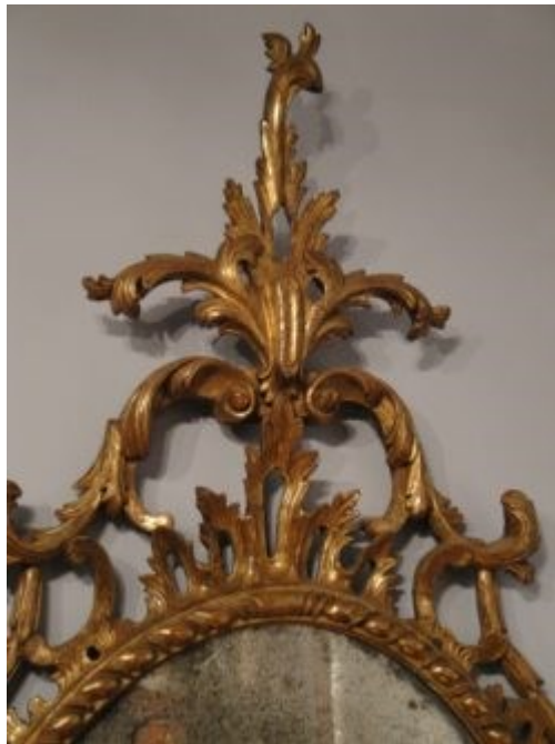
Detail of the Scrollwork on Chippendale period Mirror. Raffety Ltd.

An earlier example of the influence of chinoiserie is a charming Queen Anne period corner cupboard. Surrounding the shaped bevelled mirror plate, the lacquer decoration consists of gold decoration on a black ground. The decoration depicts vignettes of exotic birds, flowers and foliage and figures in pavilions. It is fun, and whimsical on a small-scale and in perfect condition. Both these examples show not only the long period in which chinoiserie influenced style and design, but the variations in how the chinoiserie craze was translated into everyday objects.