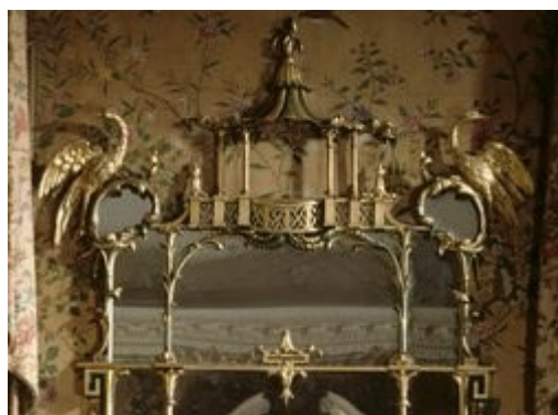
Chippendale Mirror at Nostell Priory, Yorkshire with Ho Ho Birds and Pagoda Top.

Looking at the decorative arts in the 18th century you may feel that chinoiserie really joins hands with the rococo period. Rococo was entirely French, the word 'Rocaille' - meaning 'rock-work, relating to a lively and sensual flavour, unlike the heavy baroque of the past and the Neo-Classicism of the future. Rococo was light, with asymmetrical C-scrolls, double 'C's' and swirling curves, all to resemble breakers of the sea curling on some rocky shore.