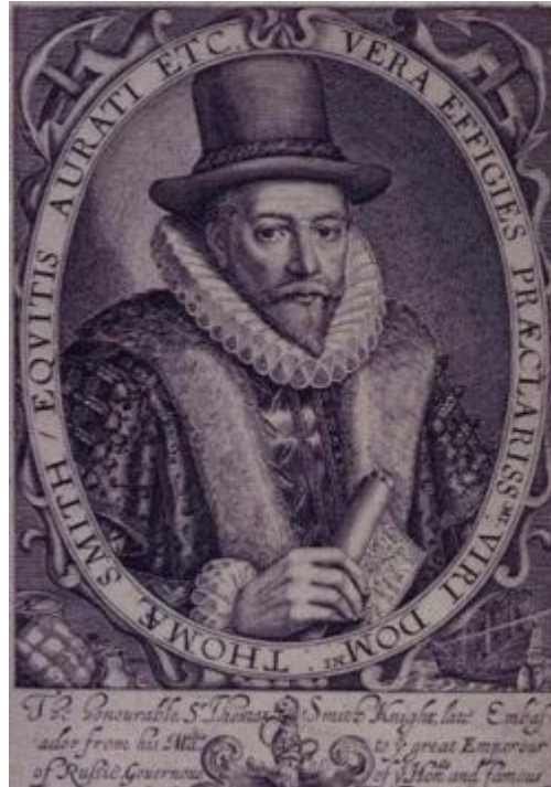
Print of Sir Thomas Smyth, First Governor of the East India Company

To distinguish between lacquered goods of East and West, ‘right Japan’ indicated Oriental lacquer whilst ‘Japan’ was used to describe European production. The import of all these exotic goods caused demand to outstrip supply so it was left to cabinet makers and skilled artisans to create ‘japanning’ of their own. The makers were successful in doing this but they never achieved the same quality of their Eastern competitors. The difference in lacquer production was that in Oriental lacquer, gum was taken from the Lac tree. In England various lacquers were based on a build – up of varnishes on a gesso ground.