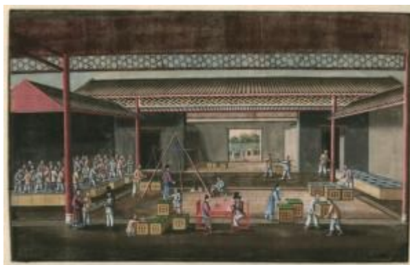
Chinese and European Traders Doing Business. Early 19th Century Print.

To distinguish between lacquered goods of East and West, ‘right Japan’ indicated Oriental lacquer whilst ‘Japan’ was used to describe European production. The import of all these exotic goods caused demand to outstrip supply so it was left to cabinet makers and skilled artisans to create ‘japanning’ of their own. The makers were successful in doing this but they never achieved the same quality of their Eastern competitors. The difference in lacquer production was that in Oriental lacquer, gum was taken from the Lac tree. In England various lacquers were based on a build – up of varnishes on a gesso ground.