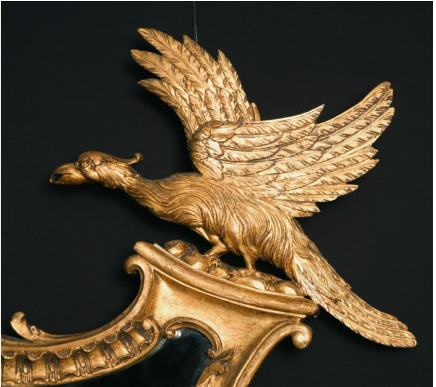
Detail of Ho Ho Bird on a Chippendale Style Mirror, 19th Century.

There were Huguenot craftsman who welcomed this new style and cabinet makers were carving 'C' scrolls intermingled with flowers, foliage, shells and rock in ornament, together with ho-ho birds and figures on clocks and furniture. The cabinetmaker, Thomas Chippendale amongst many others, welcomed the revival of the oriental taste and created many fantastic clocks and furniture. If you sneak back to an earlier period in the 18th century you can find chinoiserie taste even in gardens, take for example Sir William Chambers Chinese pagoda at Kew; an oddity for England but fabulous all the same!