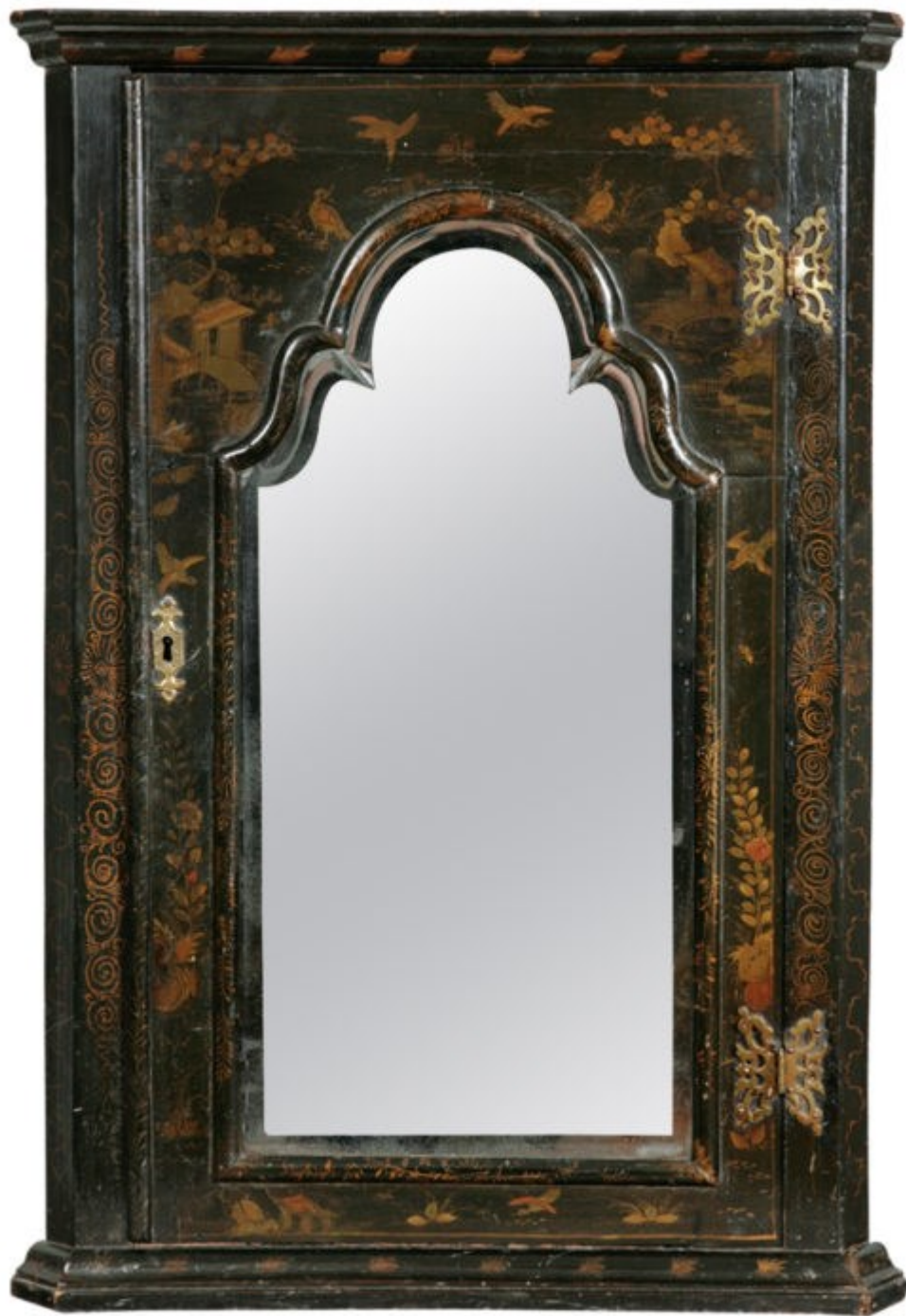
Queen Anne Period Lacquered Corner Cabinet. Raffety Ltd.