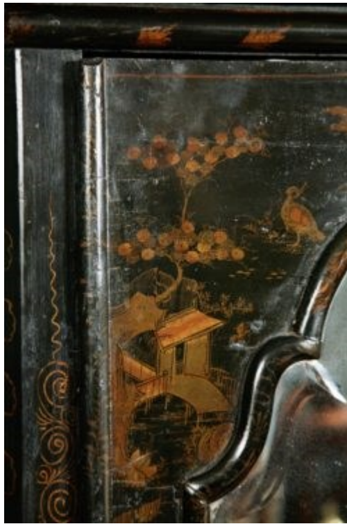
Detail of Lacquerwork on Queen Anne Corner Cabinet. Raffety Ltd.