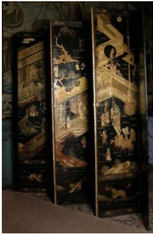
Lacquer Screen, Late 17th century.

Imports had reached their peak when there was a petition set up by cabinet makers who felt that their trade was being threatened and ruined. Heavy duties were imposed on imported furniture from 1701. The threat really only existed in the field of lacquering itself as Captain Dampier observed: